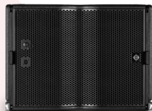
SC2-F Dual 15" Bass Extension with SC Technology for AiRAY and ViRAY