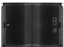
SCV-F Compact 18" Subwoofer with SC Technology