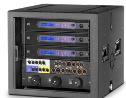
LINUS T-RACK 12-Channel Touring Rack