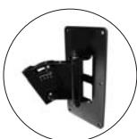
24481 Wall mount