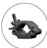
68620 Truss clamp